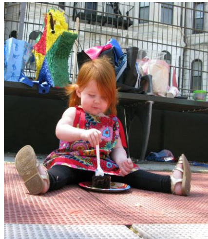
Trinity enjoying birthday cake