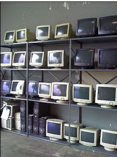
Fruits of their labor, ready to be donated!

This year, despite the rough economy (or perhaps because of it) donors were generous enough to enable me to hire three interns for the summer. These young men helped me to repair and refurbish computers to give away to other NYC ministries, they provided technical support for our office, and they helped me with a variety of office-related tasks and administrative projects among other things. I worked to build them up in a variety of aspects of their lives including giving them job skills, teaching them about careers and working in office environments, doing Bible studies and having discussions about faith, and even just talking about life in general.